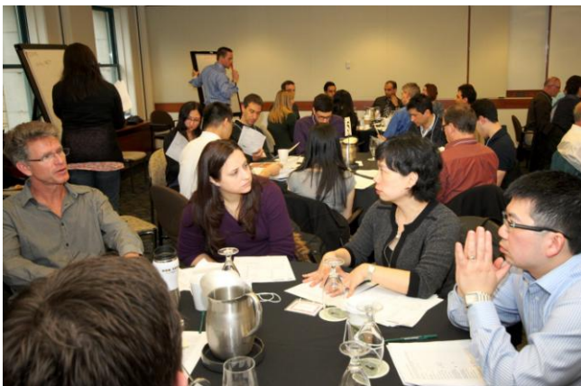
Thoughtful discussion at the Peer Circle