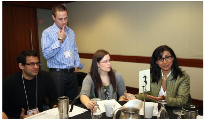
An animated exchange at the Peer Circle

This was followed by an opportunity to write the same Jurisprudence Exam that applicants for registration must write and pass. For those registered before 2009, it was an opportunity to explore the differences in our new regulatory legislation.